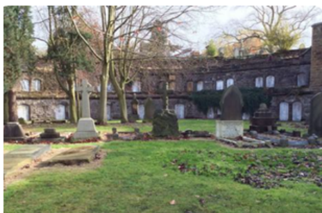
Key Stone Cemetery and Cadburys Factory, Birmingham