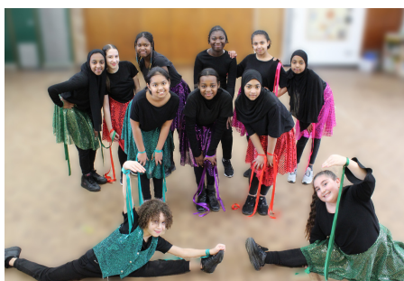
After School Dance Club win Birmingham School Games Competition