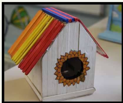
Year 6 Bird Box Example