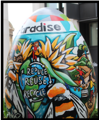
Unveiling of one of the the Easter Eggs

This week Year 4 participated in a Roman Experience Day here at school. They explored the dramatic change in lifestyle following the arrival of the Roman legions to Britain. These experiences really help to reinforce what the children have learnt in their history lessons, and as always, the company delivering the sessions was impressed with year 4's conduct and behaviour.