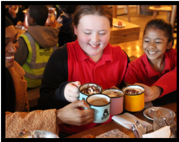
Year 6 children enjoying a hot chocolate and cakes at Albert Schloss