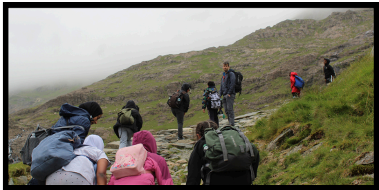
YEAR 5 MOUNT SNOWDEN, WALES