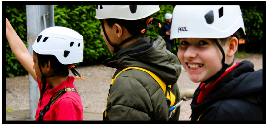
YEAR 6 AT BLACKWELL ADVENTURE

A special mention goes to the children and my staff who attended the Mount Snowdon field trip in Wales. The activities were physically demanding, including river gorging, bush crafting, and a long mountain hike.