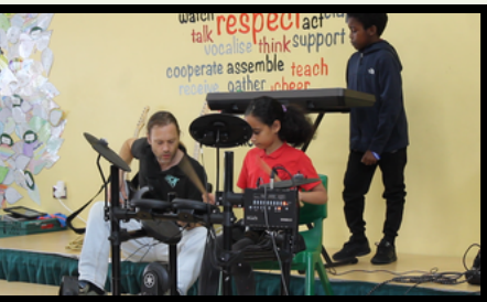
Rock Band-Year 4