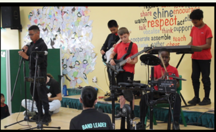
Rock Band Year 5