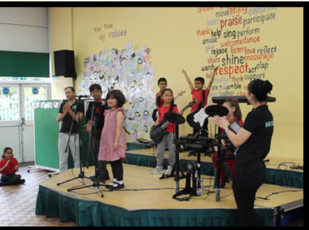
Rock Band-Year 2