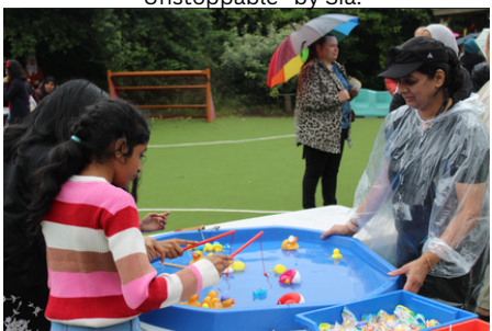
Mrs Ashraf running the popular "hook a duck" stall.