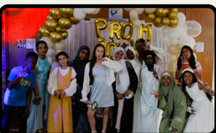
One of the many prom photos. They scrub up well!