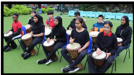
Our Djembe musicians performing "Unstoppable" by Sia.