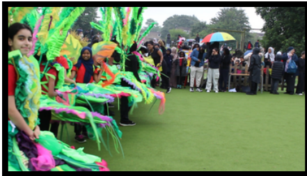
Carnival dance at the summer fair