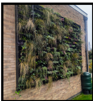
Our newly installed flower/plant wall,