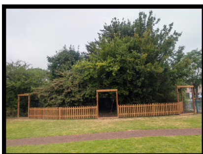
Over the summer we created a new hideaway/retreat area for the children to play in.